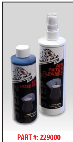
PART #: 229000